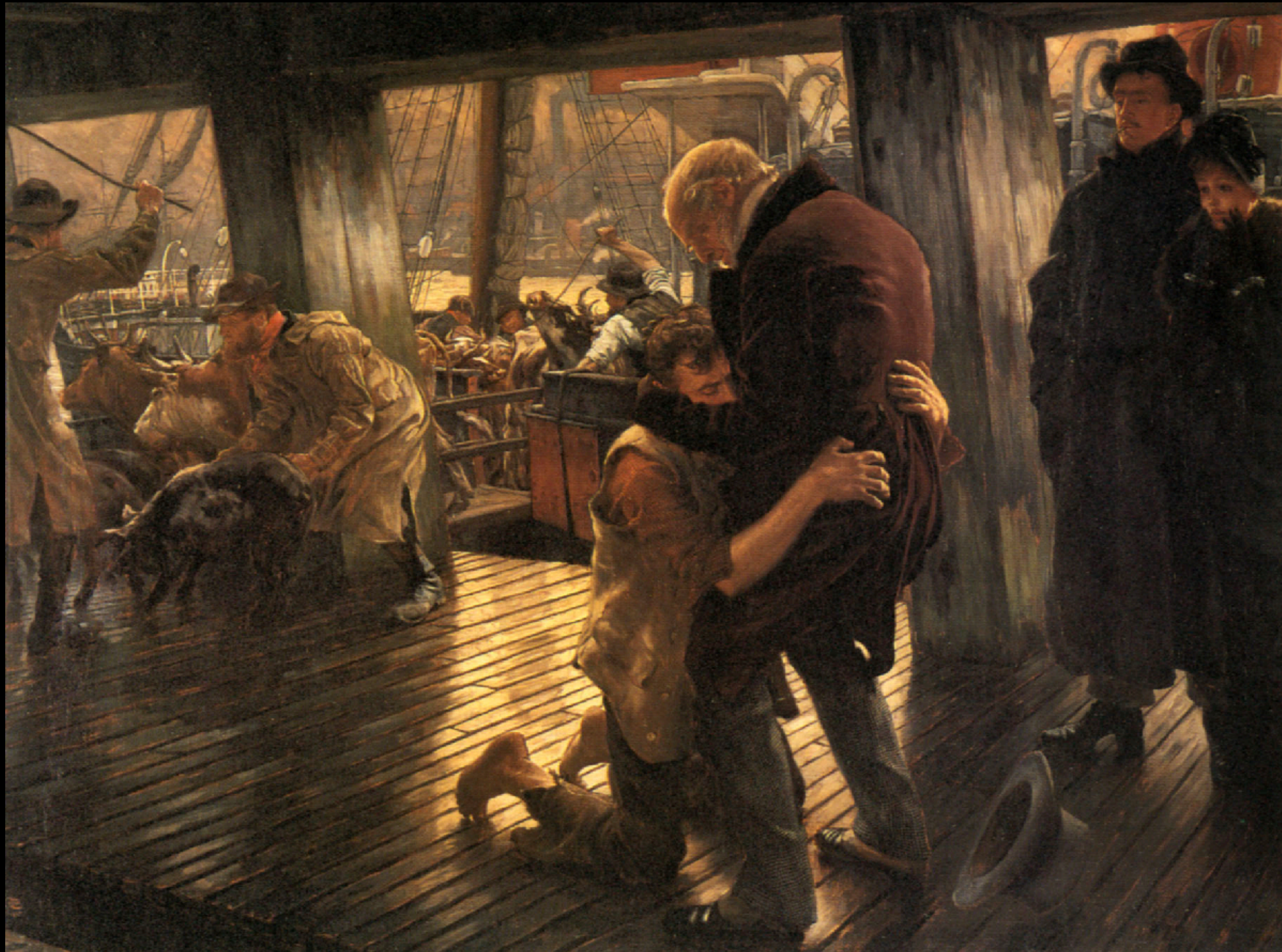
James Jacques Joseph Tissot (1836-1902) The Prodigal Son in Modern Life: The Return. Oil on Canvas (c. 1882) Musée de Nantes, France.