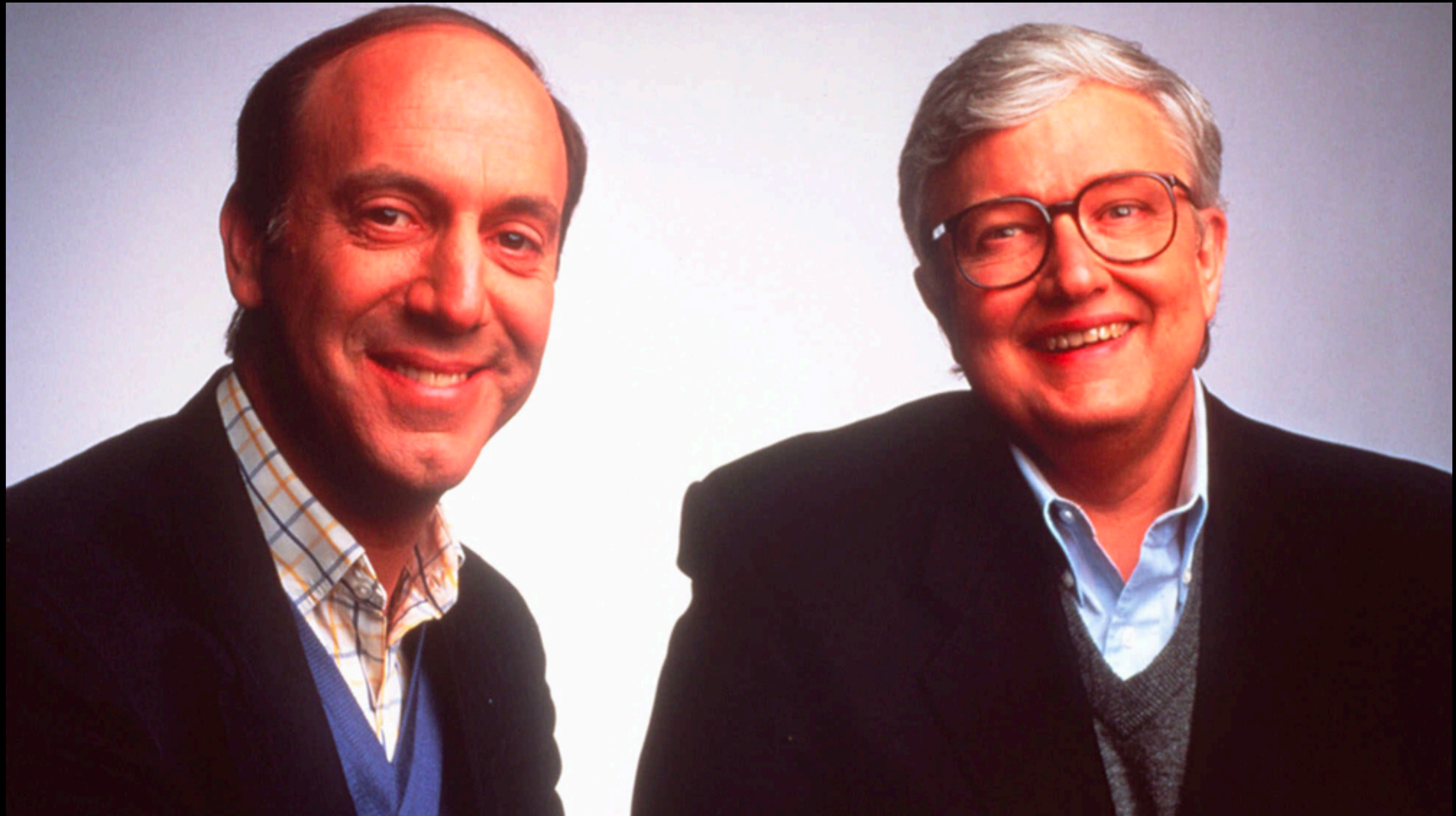
Siskel & Ebert